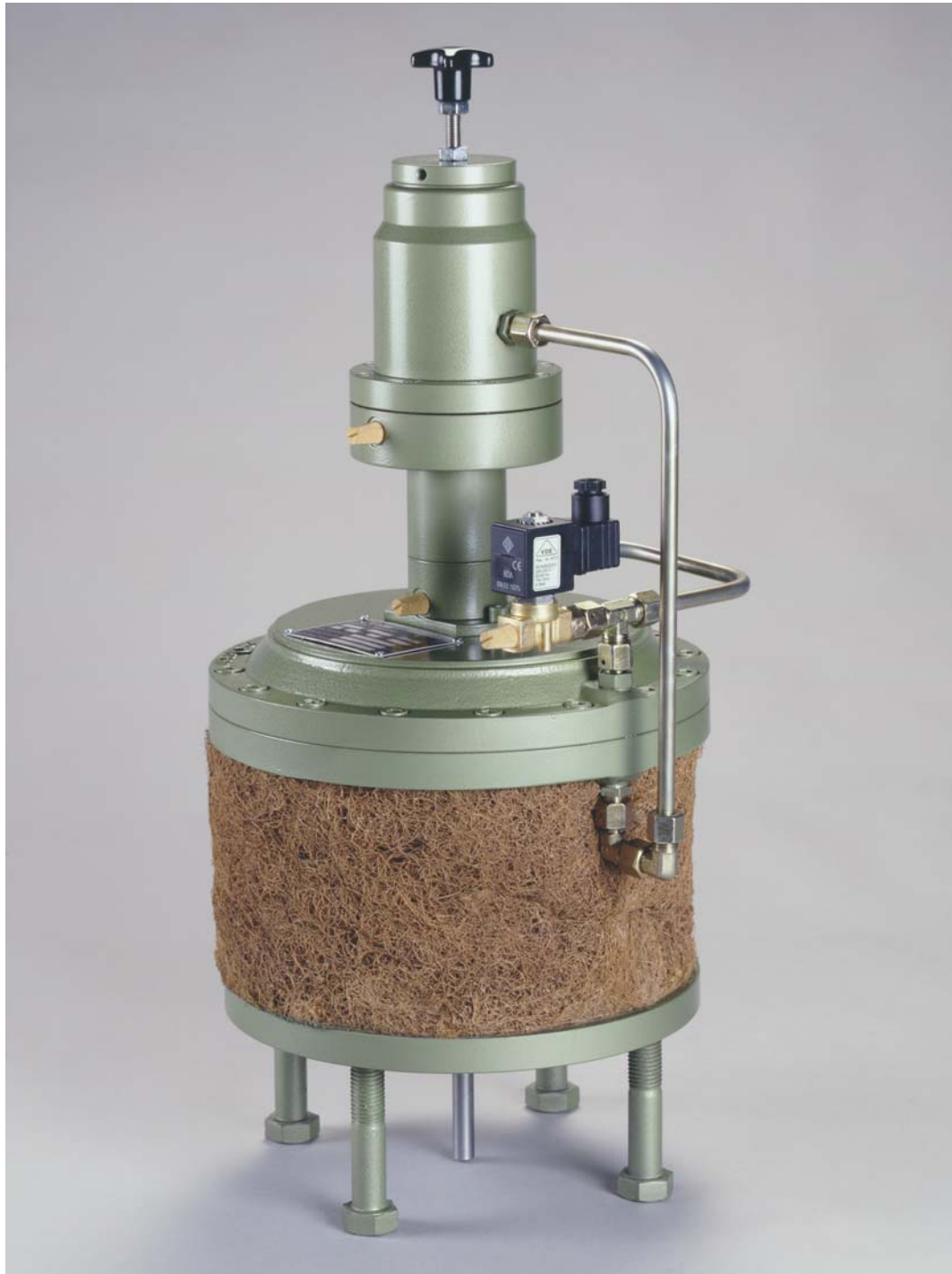
Image: 1 - Overflow regulator Type 86